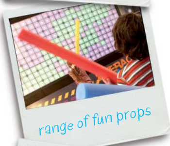
range of fun props