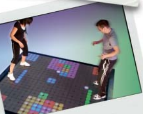
adult family fun