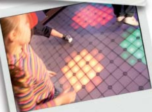
party fun games