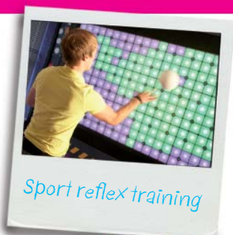
Sport reflex training