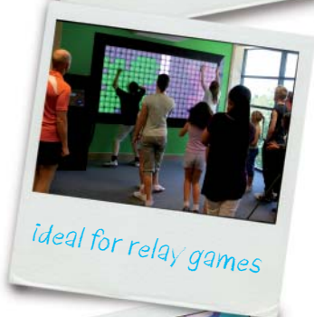
ideal for relay games